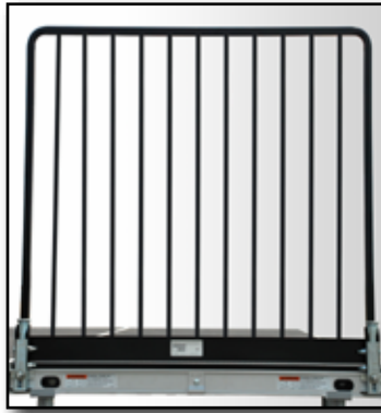
Four foot guard panels (vertical above and horizontal right)

Guard panels have been designed for quick assembly to increase productivity during installation and disassembly. Unique clamps snap into the side channel of the decks and release by depressing a plunger.