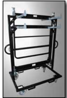
Storage cart holds up to 16 guardrails