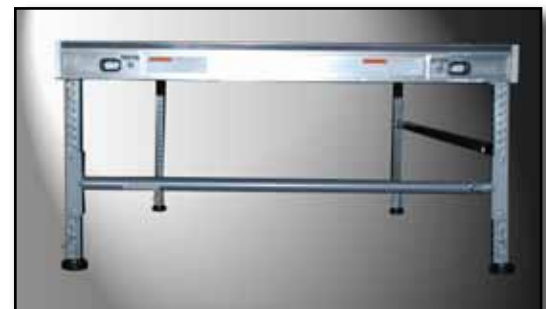
4' Horizontal Brace

Traditional cross bracing will also work with the AS 2100 understructure.