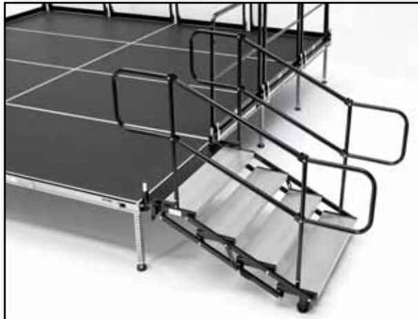
Four Step Ultra-Stair

The Ultra-Stair decreases set up time and labor. Multiple options are available for platform heights from 12" to 80". The units, with detachable handrails, fold flat for storage and ease of shipment.