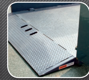
Low Angle Ramp For low clearance loading.