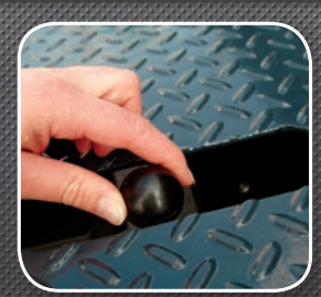
Single Lever Control 12-volt hydraulic system is proportional in both directions.