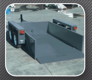
Large Deck Up to 72 inches wide to hold more payload.