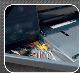
Storage Compartments Protects components and tools; lockable.