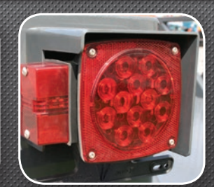
Shielded Tail Lights Added protection with improved visibility.