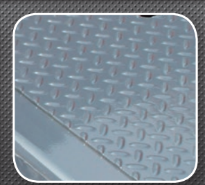
Powder Coating Provides durable protective finish.