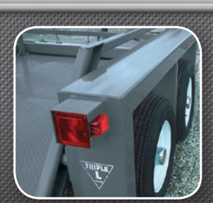
Fenderless No protruding fenders that are susceptible to damage.