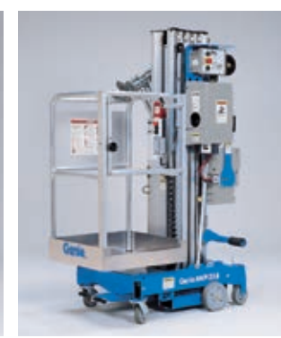
Gated Standard Platform 27 x 26 in (69 x 66 cm) Provides "step in" entry.