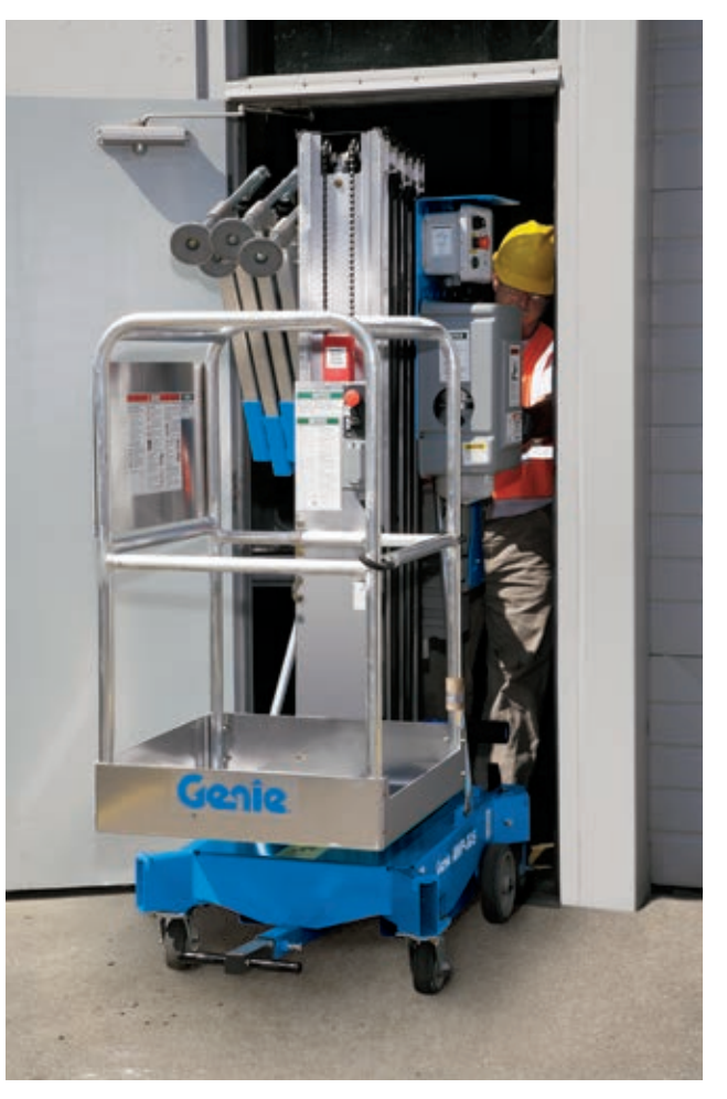
Doorway Access and Maneuverability

The patented Genie<sup>®</sup> mast system is the most rigid in the industry. Constructed of durable aircraft-quality aluminum, the mast provides user comfort and security at all working heights. Units have a ground fault interrupter receptacle on the platform for convenient use of power tools. (ANSI/CSA only)