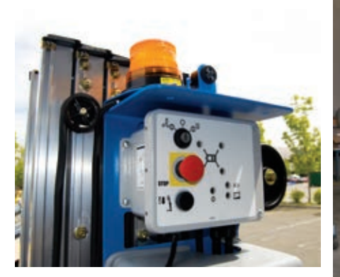
Operational Warning Light

0 = 0ption * = Not avilable in CSA \mathbf{S} = \mathbf{Standard}