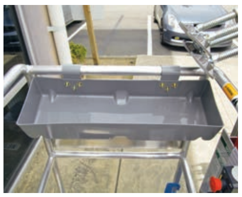
Work Station Tray (not available on narrow or ultra-narrow platforms)