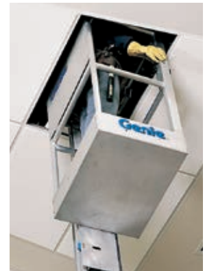
Narrow Platform The narrow platform option is perfect for accessing the space above ceiling tiles.