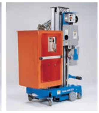
Standard Fiberglass Platform* 29 x 26.5 in (74 x 67 cm) A general-purpose fiberglass platform designed for containing tools and materials.