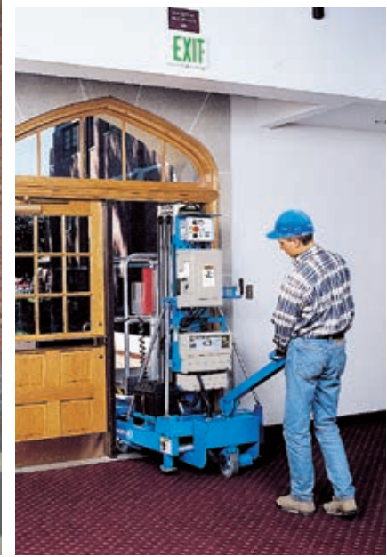
* Shown with power wheel assist option

Rigid aluminum mast provides user comfort and security, and features heavy-duty lifting chains for strength and reliability. Units also feature built-in automatic level sensing. Two front integral leveling jacks provide an additional 2 in (5 cm) of adjustability.