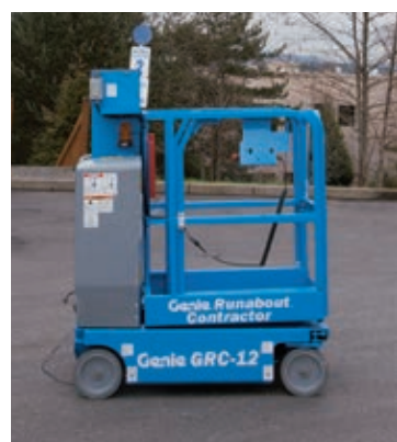
GRC Rigid Steel Platform Strong steel platform with standard extension deck offers an extra 16 inch outreach.

* Fiberglass platforms do not provide protection from electric shock.