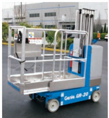
Sliding Mid Rail Extension Deck Platform 55 x 29.5 in (140 x 75 cm) provides 20 in (51 cm) of horizontal outreach and a larger work area within the platform.

* Fiberglass platforms do not provide protection from electric shock.