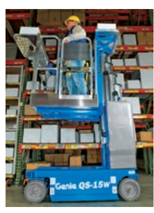
Stock Picker<sup>™</sup> Platform 35 x 28.5 in (89 x 75 cm) Offers dual side entry gates and front-folding tray.