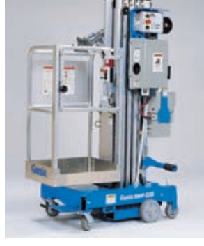
Gated Narrow Platform 26 x 20 in (66 x 51 cm) For access through standard ceiling tile and other small openings.