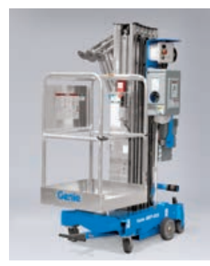
Standard Platform With Sliding Midrail 27 x 26 in (69 x 66 cm) An excellent generalpurpose platform.

AWP<sup>®</sup>, IWP<sup>®</sup> and Runabout<sup>™</sup> Platform Options