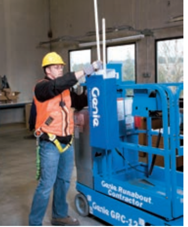
Fluorescent Tube Caddy (only available on narrow or standard platform)